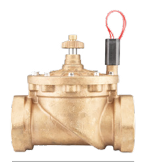
IBV-301G-FS Inlet diameter: 3" (80 mm) Height: 23 cm Length: 22 cm Width: 18 cm