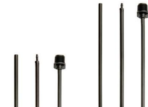
RIGID RISER 12" and 18" lengths